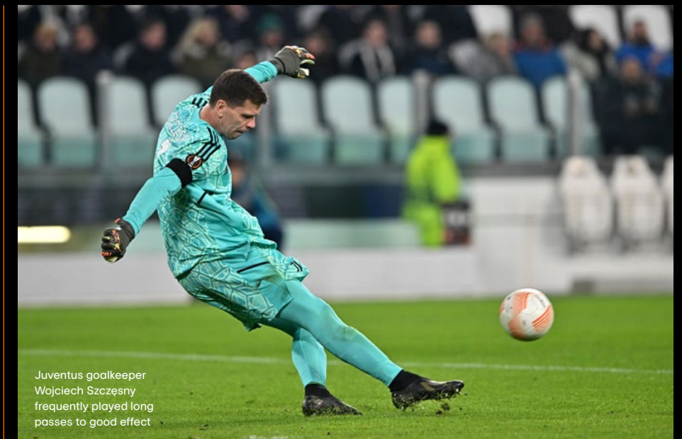
Juventus goalkeeper Wojciech Szczęsny frequently played long passes to good effect