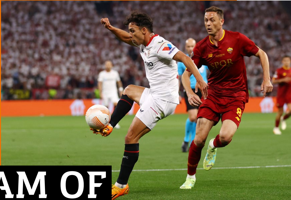
Nemanja Matić keeps a close eye on Óliver Torres during the final