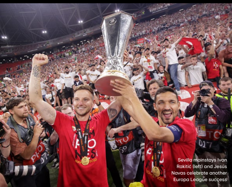
Sevilla mainstays Ivan Rakitić (left) and Jesús Navas celebrate another Europa League success

Our observers have put together their key takeaways from the season – including wise heads and long balls – in advance of the full report