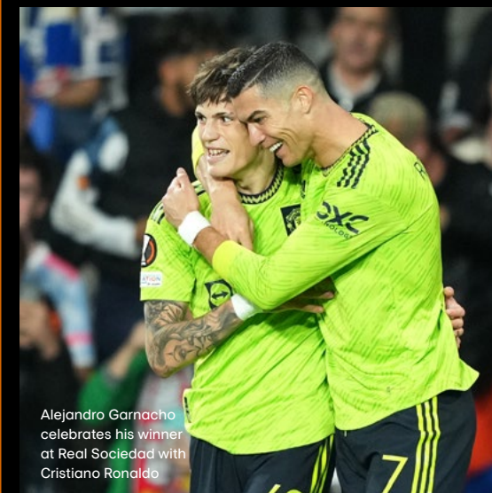
Alejandro Garnacho celebrates his winner at Real Sociedad with Cristiano Ronaldo

Manchester United only finished second in Group E, despite picking up 15 points by winning five of their six matches. The issue was that Real Sociedad also won five from six, and in the process managed what none of the other 13 teams visiting Old Trafford in all cup competitions last season could: victory. To complete the symmetry, their one defeat came at home to United on Matchday 6. That game proved notable as Cristiano Ronaldo, in his last European game for United, set up Alejandro Garnacho for his debut goal in European competition. It was only the second goal Real Sociedad conceded in all six group games – better than the three United let in, which ultimately forced the English side into runners-up spot.