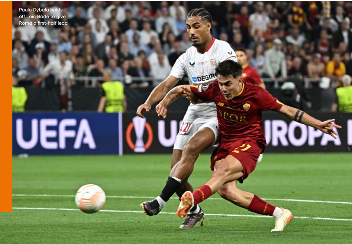
Paulo Dybala holds off Loïc Badé to give Roma a first-half lead