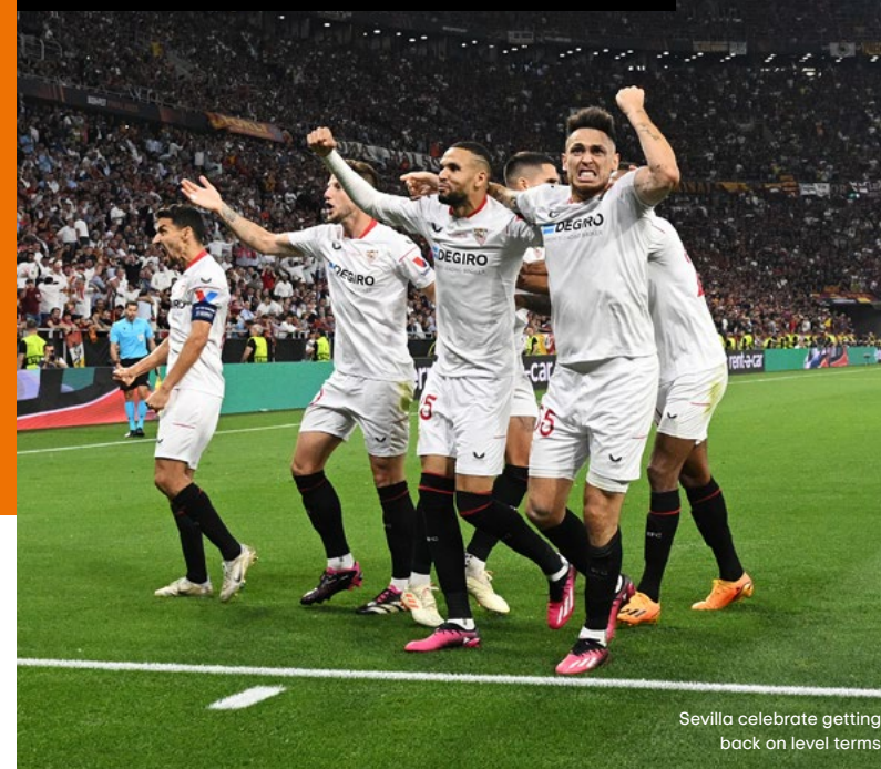
Sevilla celebrate getting back on level terms

UEFA's technical observers were keeping a close eye on the action as Sevilla eventually defeated Roma on penalties to win the title for a seventh time