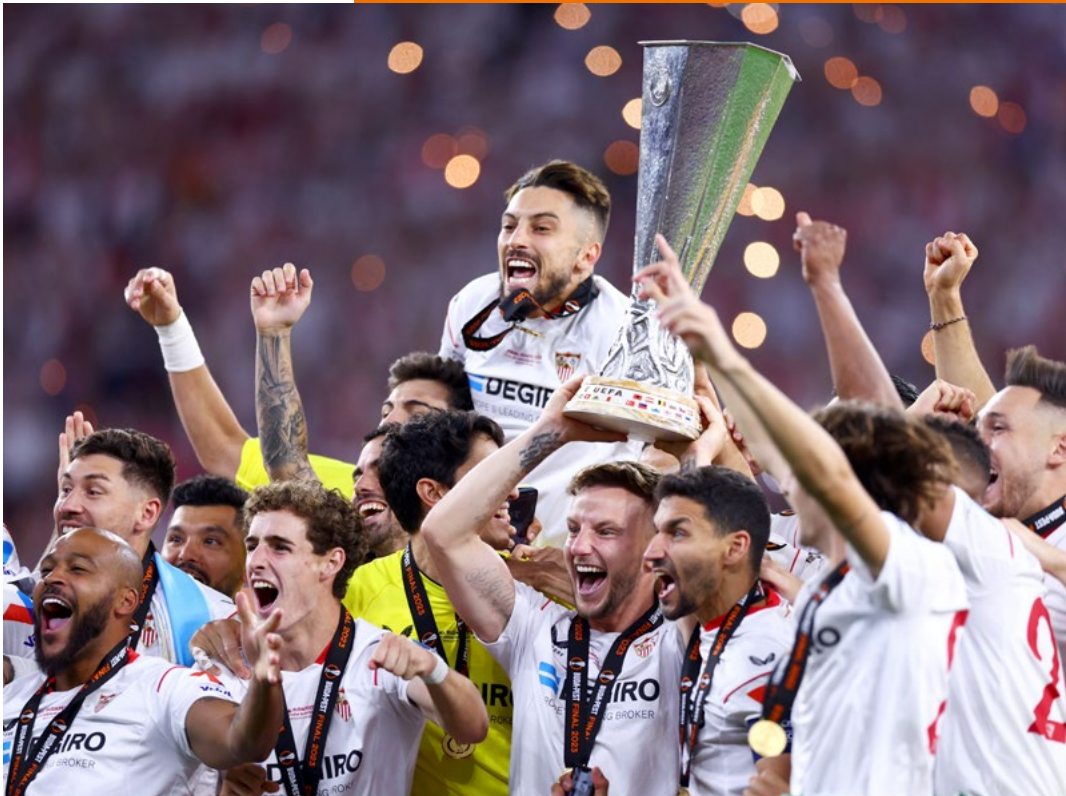
Ivan Rakitić and Jesús Navas lead the Sevilla celebrations as they lift the trophy again

“Navas got higher in the second half and as the game went on, Sevilla’s pressure and more possession – 66% for Sevilla to 34% for Roma – meant the distances increased between the Roma players and Rakitić could exploit those spaces with a variety of balls forward into