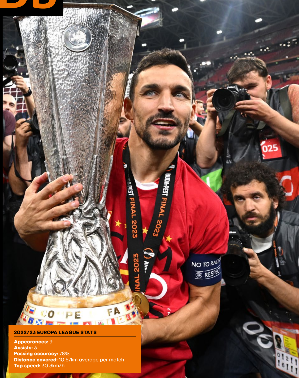
Sevilla captain Jesús Navas with the trophy (left); Florian Wirtz jumps for joy after scoring for Leverkusen against Union SG

Appearances: 9 Assists: 3 Passing accuracy: 78% Distance covered: 10.57km average per match Top speed: 30.3km/h