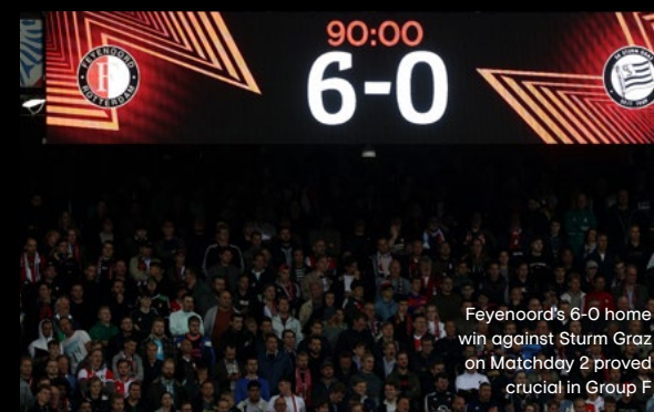
Feyenoord's 6-0 home win against Sturm Graz on Matchday 2 proved crucial in Group F

Group F was fascinating, with all four teams finishing on eight points, each winning two, drawing two and losing two. Lazio and Sturm Graz headed the group going into Matchday 6, but both suffered defeats. With overall goal difference needed to separate the teams who were tied on head-to-head results, Feyenoord's 6-0 victory over Sturm Graz in the second round of fixtures was crucial in the Dutch club eventually finishing top and advancing – and the Austrian side being eliminated from European competition in fourth place. Midtjylland squeezed through in second.