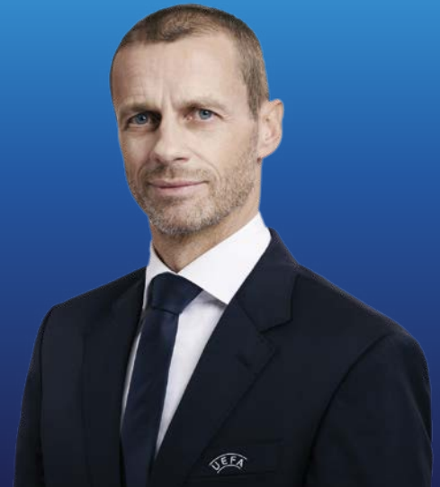
Aleksander Čeferin UEFA President

UEFA is working strategically towards its statutory objective to protect the game by reinforcing knowledge, skills and networks. We are putting words into action in the UEFA FTF programme, calling upon some of today's best experts and academics in the field and pushing participants to deep dive into each essential aspect of the fight – detection, intelligence, prosecution – in a hands-on approach.