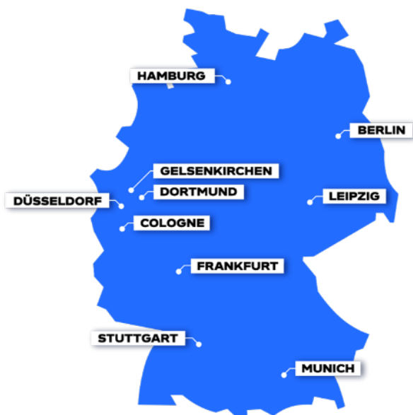
Figure 1: Map of UEFA EURO 2024™ Host Cities

The rental period for all containers is foreseen to be approximately four (4) months, beginning end of March 2024.